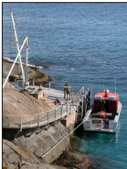
Montague Island's jetty