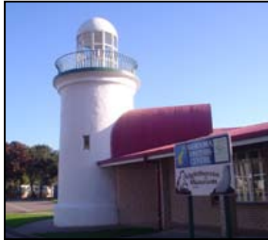
Narooma Visitors Centre