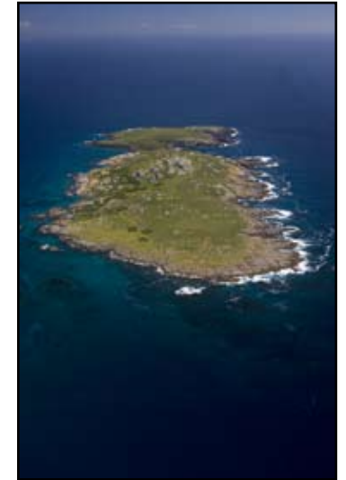
Montague Island from the north

This is a general guide only. You may have special needs or your group may require additional information.